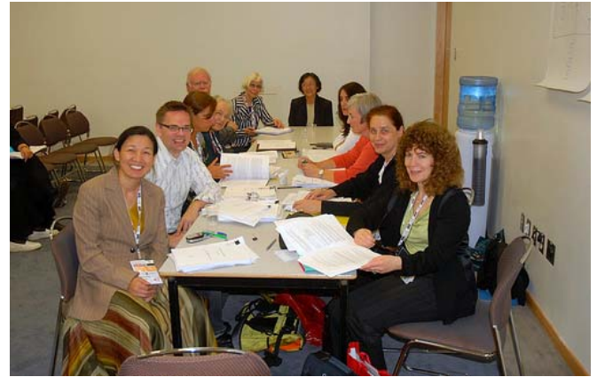
FRSAR Working Group meeting, Québec