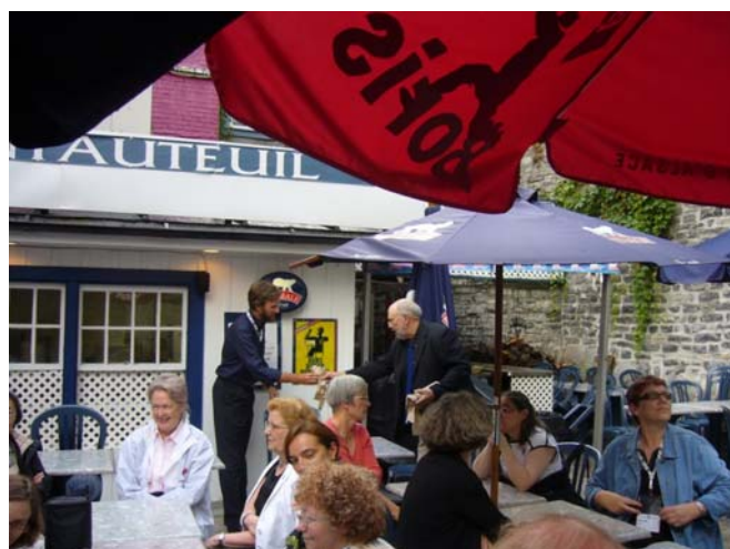
Division IV Social Hour, Québec

Founded in 1985, the IFCS is a federation of national, regional, and linguistically-based classification societies. It is a non-profit, non-political scientific organization, whose aims are to further classification research. Amongst other activities, the IFCS organises a biennial conference , publishes a newsletter , and supports the Journal of Classification (JoC) and the Journal Advances in Data Analysis and Classification (ADAC). In addition to the participating Member Societies , the IFCS comprises a Group-at-Large , which serves the interests of individuals for whom there does not yet exist an appropriate classification society.