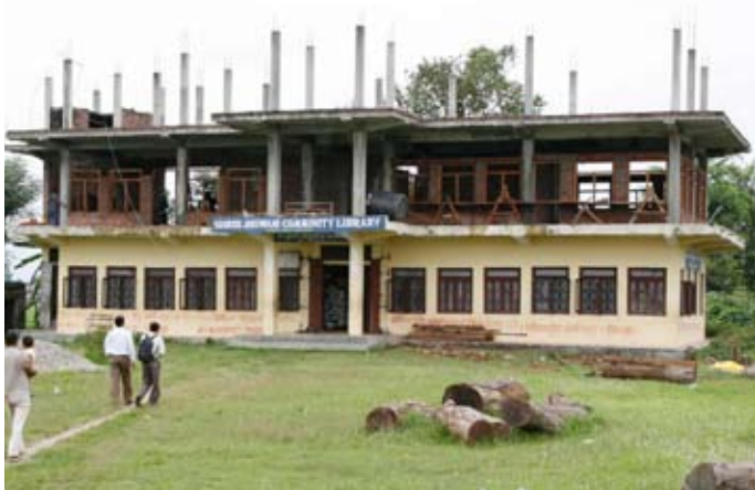
The Jhuwani Community Library

READ Nepal was founded in Kathmandu in 1991 to establish a library system that could help rural Nepalis advance their own educational, economic, and community development.