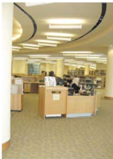
Ready to serve the students