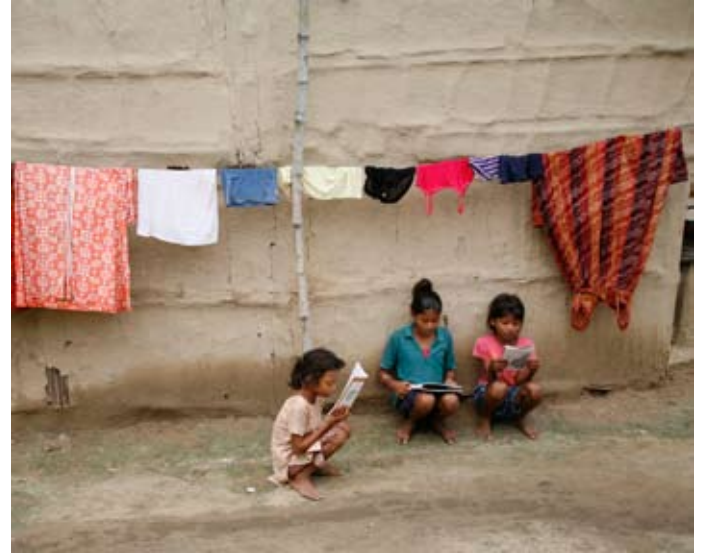
Children read books from Jhuwani Library

several ethnic groups, including Tharu, Newar, Magar, and Gurung, the library has sponsored a poetry festival and a writing contest for children. A women’s literacy group in the village applies for loans to support small, home-based businesses, such as candle-making and raising goats.