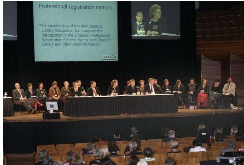
Professional registration voting at LIANZA Conference, Wellington, October 2006

also runs a national “Library Week” promotion campaign and publishes a biennial remuneration survey.