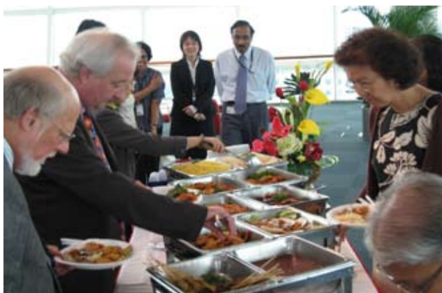
IFLA RSCAO committee members hosted to lunch at the Pod, National Library Board Singapore during their visit