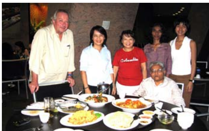
Welcome Dinner at the No Signboard Restaurant at Esplanade Mall on 18 March 2007