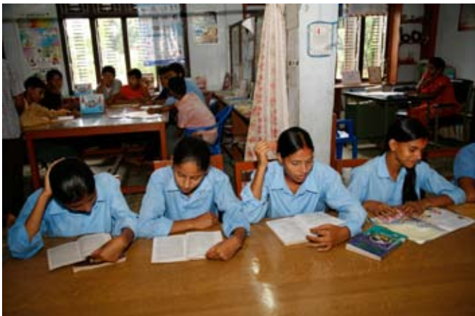
School girls read in Argyole Community Library

In the 15 years since its inception, READ has facilitated access to books, newspapers, computers, and other educational materials for hundreds of thousands of Nepalis. People who cannot read watch videos or listen to audiotapes, to learn about investment and microfinancing opportunities, for example. The libraries also serve as social hubs for child care, medical assistance, literacy training, women’s discussion groups, AIDS awareness programmes, and farming and animal husbandry workshops. These vital social services are provided through READ partnerships with Nepali social welfare providers and university libraries, Nepal National Library, Asia Foundation, and the United Nations Educational, Scientific and Cultural Organization (UNESCO).