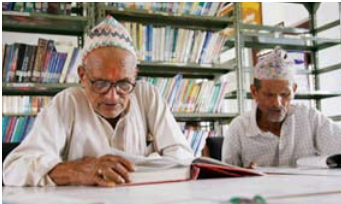
Rural Education and Development (READ) Nepal received the 2006 Access to Learning Award for its innovative approach to building and sustaining village libraries. No-cost access to books and information technology is advancing learning and literacy in the country's underserved, rural population.

Possessing eight of the world's 10 highest peaks, Nepal is among the most mountainous countries in the world. It is also among the least economically developed: of its 28 million people, nine out of 10 live in rural areas, fewer than half have electricity, and one in three lives below the poverty line. Only half of adult Nepalis—and only one-third of women—can read or write.