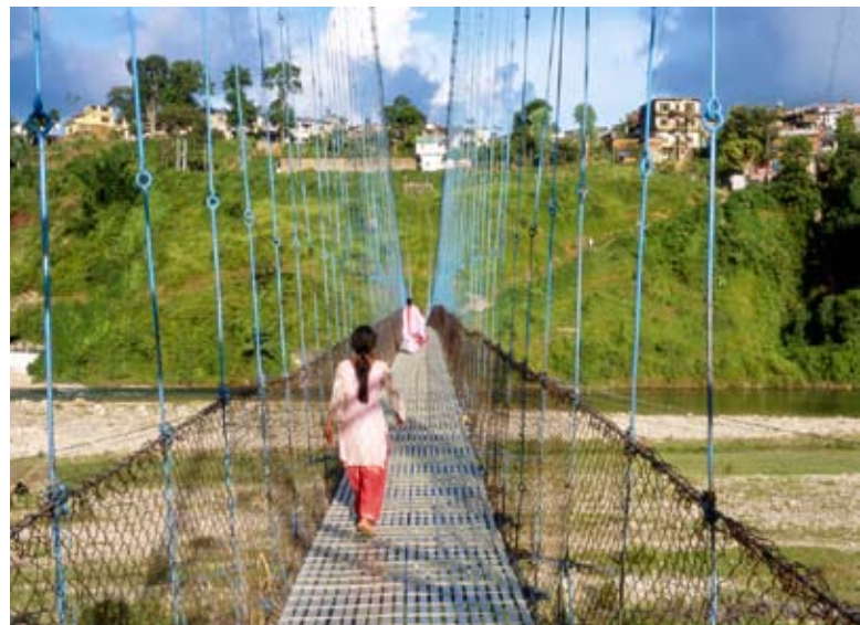
The new bridge now shortens the walk to school

Before construction begins, villagers develop a business plan to cover the anticipated costs of ongoing operations. Undertakings have included a furniture factory, a printing