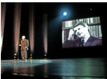
The inauguration of Zbigniew Herbert's Year

On February, 18th 2008 the inauguration of Zbigniew Herbert's Year was held. The ceremony took place in the National Theatre in Warsaw. The first part comprised of monodrama with Herbert's texts, acted by one of the famous Polish actors Zbigniew Zapasiewicz. The second part was the multimedia show. The ceremony took part in presence of most important Polish personages including spouse of the President of Poland – Maria Kaczyńska.