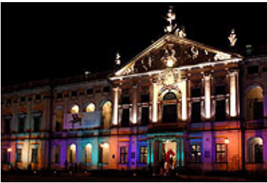
The Palace of the Commonwealth during the Long Night of Museums

In this year, for the first time, the National Library took also part in the Long Night of Museums. On May, 17 2008 the exhibition Norwid-Herbert. Drawings. Mediterranean inspirations was open till 1 a.m. More than a thousand visitors watched it during this one night.