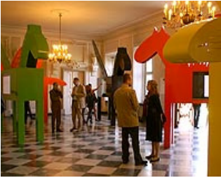
The exhibition Norwid-Herbert. Drawings. Mediterranean inspirations

In this year, for the first time, the National Library took also part in the Long Night of Museums. On May, 17 2008 the exhibition Norwid-Herbert. Drawings. Mediterranean inspirations was open till 1 a.m. More than a thousand visitors watched it during this one night.