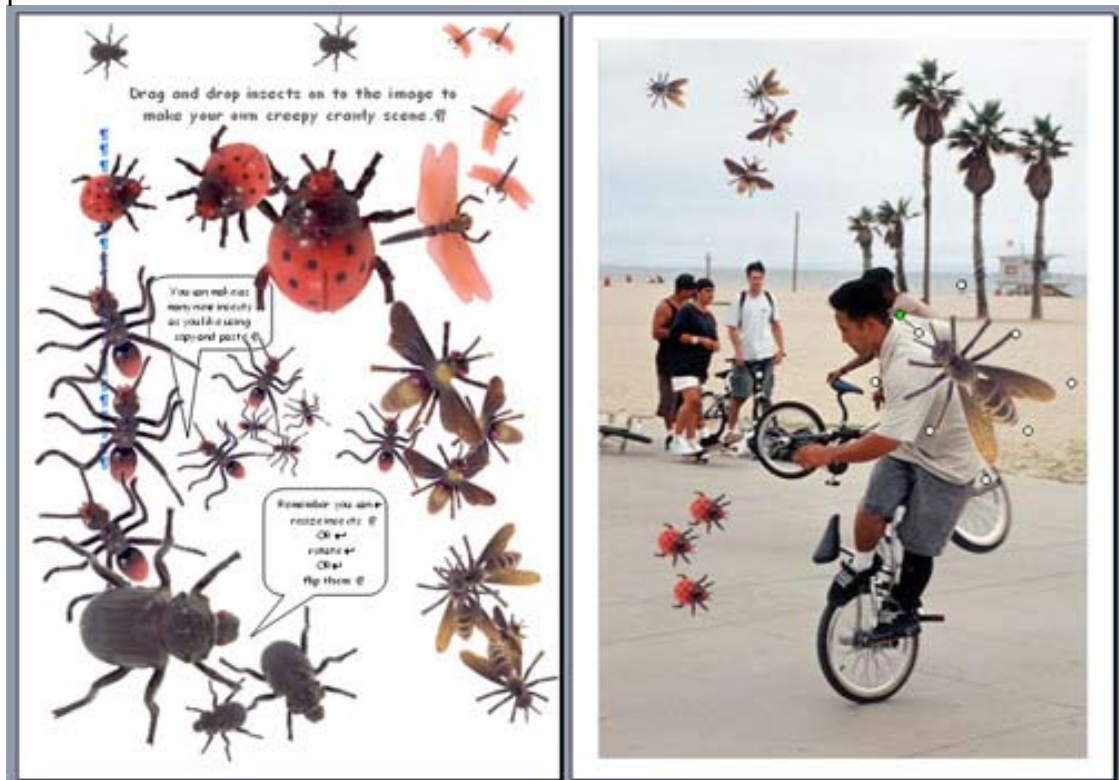
Fig 1 The "Sticky Pix" Tool – for Childrens' Activity Workshops

In 2004, a pilot programme was launched, fully funded by central government in Scotland (the Scottish Executive), which licensed these materials and tools to every local library authority in the country. Thanks to this, Scottish public libraries have been able to build up a body of good practice in exploiting the available digital resources to provide innovative end-user services to their communities.