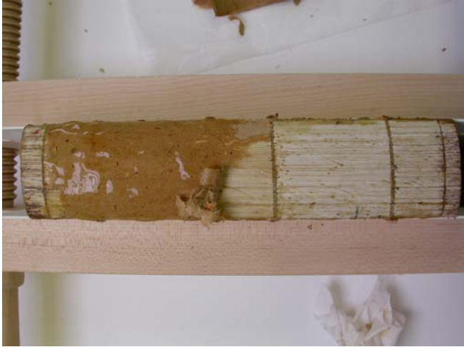
Fig.1 removal of spine lining using poultice method