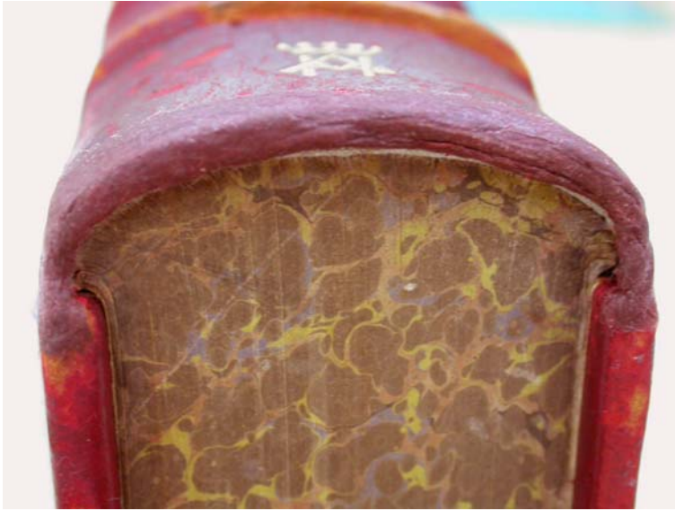
Fig.16 after re-enforcement