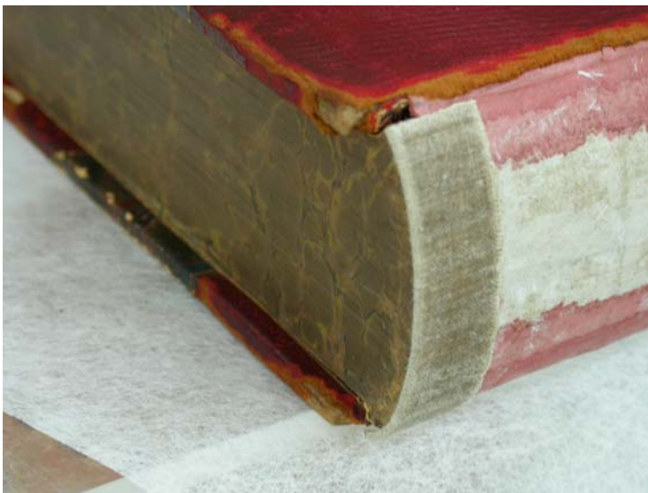
Fig.11 stuck on endbands