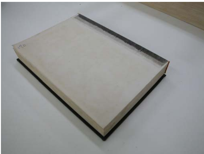
Fig. 6 after board removal