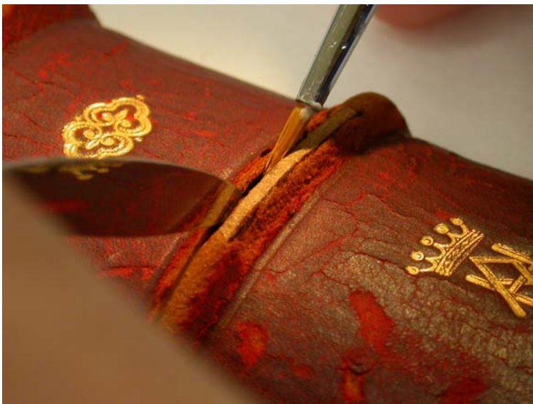
Fig.14 securing loosen areas