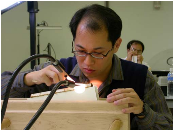
Fig.2 working on spine lining removal