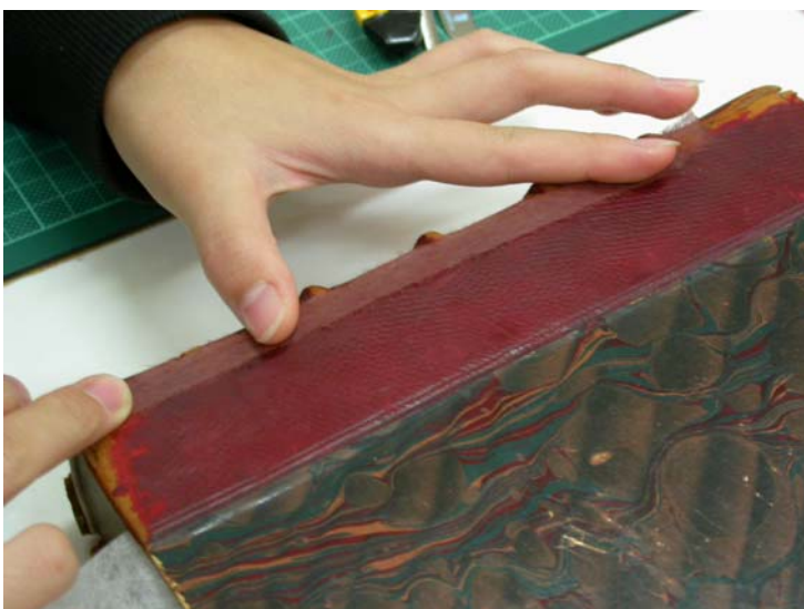
Fig.12 after board attachment