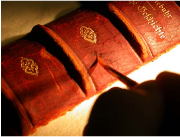
Fig.4 leather consolidation