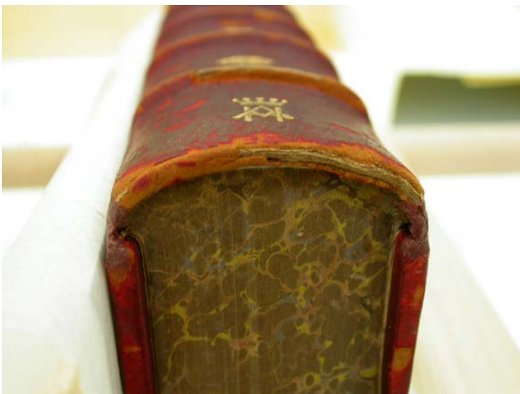
Fig.15 before re-enforcement