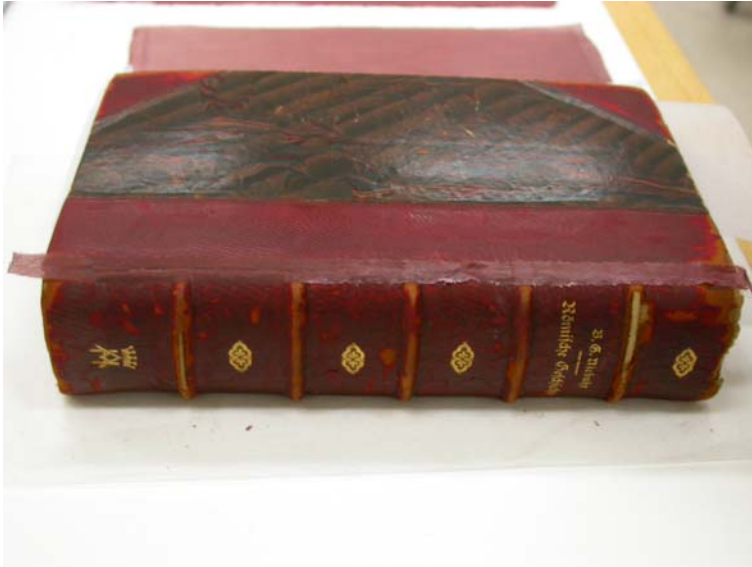
Fig.13 after board attachment 2