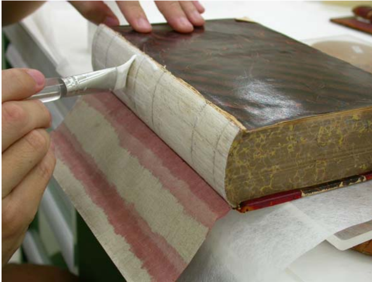
Fig.10 during board attachment