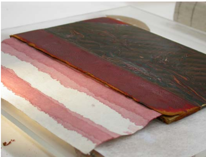
Fig. 9 Japanese tissue insert in detached board