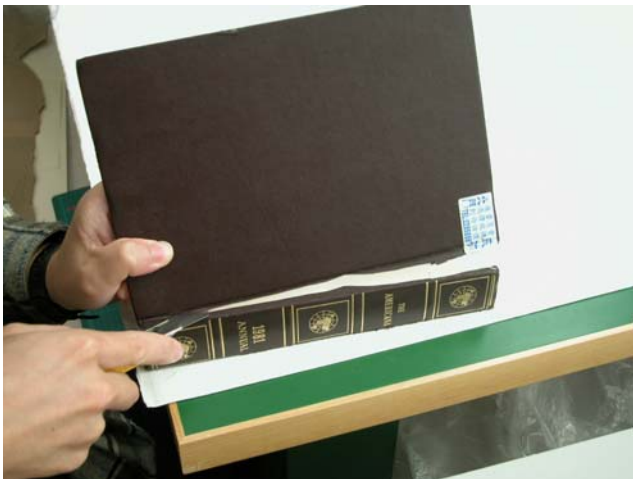
Fig. 5 board attachment on mock-up object