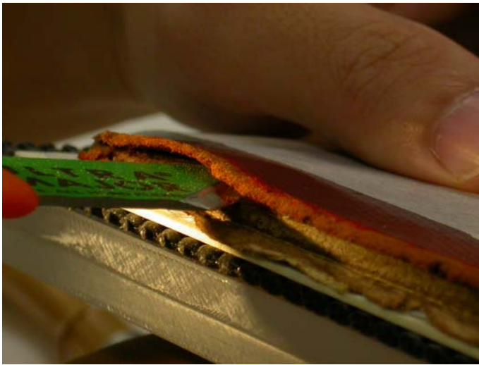
Fig. 8 board splitting for Japanese tissue insert