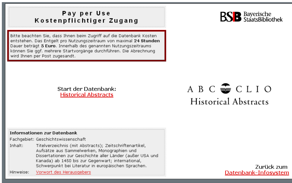
Illustration 3: Final screen before entering the pay-per-use database

What are the pros and cons of this approach in terms of electronic literature supply on a nation-wide basis and from an enduser's point-of-view? On the one hand it can be stated that it is certainly an on-demand model, i.e. only those accesses are paid for which are really needed. It opens access to those user groups whose institutions cannot afford to purchase a license for their campus and anyone unaffiliated with such an institution. So enduser coverage is the broadest possible.