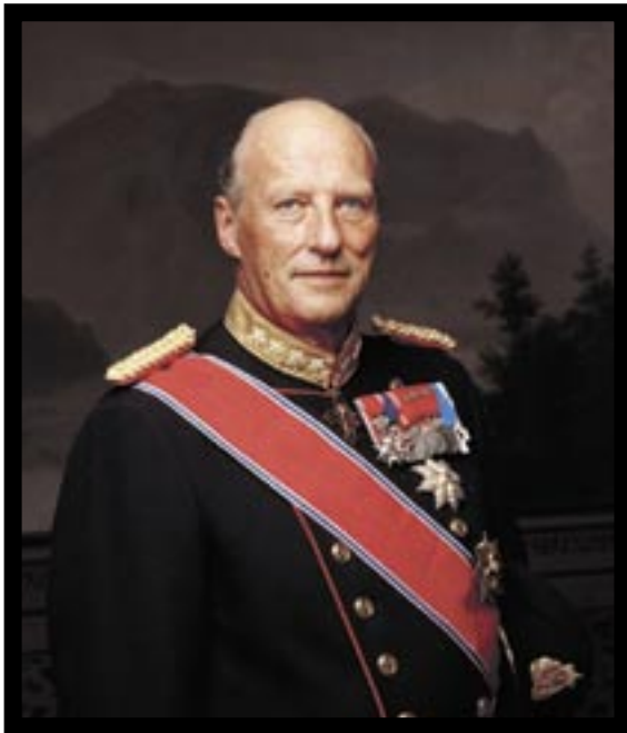
His Majesty King Harald V of Norway