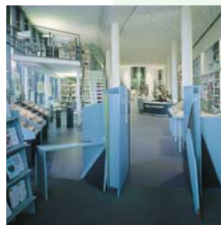
Stuttgart, city library (music library)