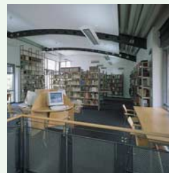
Bad Hersfeld, city library

Things that used to take weeks can now be done in a flash, thanks to electronics: through German interlibrary loans and various document supply services, one can order in paper form or electronically nearly any publication one wants that is not available in one's local library. A network of six regional association central offices coordinates interlibrary loans, collects and stores all media-related data on stock held in the academic libraries, making it available on the Internet in the form of a "virtual library catalogue".