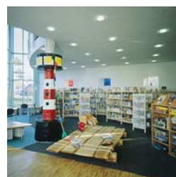
Westerstede, city library