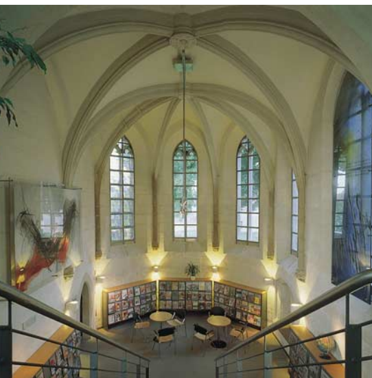
Halberstadt, city library

There are approximately 10,200 public libraries and 4,000 academic libraries in Germany. They are financed and maintained by the municipalities and the Federal Länder, as well as some by church and private institutions and foundations. Decentralisation is having a marked effect on the libraries system - unlike in many other countries, there is no libraries law in Germany, and certainly no central steering by a state or private institution. This situation has arisen for historical reasons, as the responsibility for cultural matters, academic life and art, as well as for education, is mainly the prerogative of the Länder. The municipalities also share this cultural sovereignty; their voluntary tasks include activities such as maintaining theatres, museums and libraries.