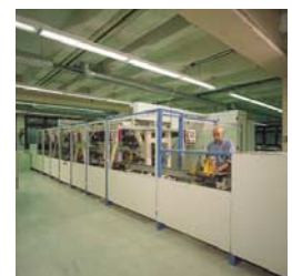
Reutlingen, ekz foiling machine