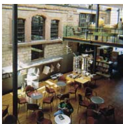
Landau, city library

The libraries are facing up to the challenge of providing information, media and services for the modern age, and it is a long time since only books and journals were available. Now there are also games, CD-ROMs, films, DVDs and audio books, and whatever else anyone with an interest in the media wants. The ability to read and to engage in lifelong learning, competence in using the media, and methodical skills to engage in research and critically recognise important information are elementary cultural techniques urgently required by everyone to be able to cope with school and training, working life and the everyday world.