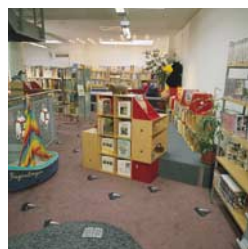
Bernburg, city library (children's library)