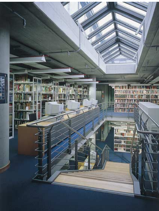
Munich, Historicum of the university library