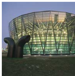
Dortmund, city and regional library