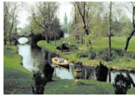
The Garden Kingdom of Dessau-Wörlitz