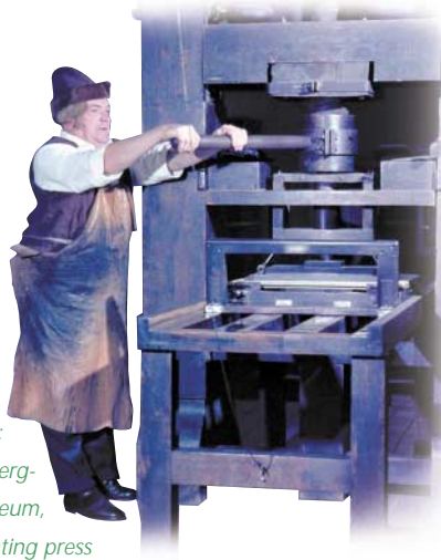
Mainz/Rhein: Gutenberg- museum, printing press

well as half- or full-day excursions into the immediate surroundings. Further details about various offers can be found in the Final Announcement and on the website. Please note: the registration deadline for pre- and post-conference tours is 31 May 2003.