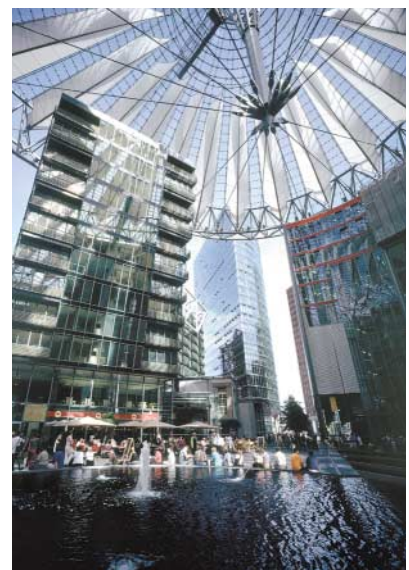
The Sony Center at Potsdamer Platz

Following the successful example of IFLA 2002 in Glasgow, the IFLA 2003 Berlin organisers are pleased to announce a similar fee structure that ensures affordability for all. Apart from full-time participation at Euro 350 for IFLA members, we also offer a "flying visitor" registration at Euro 200 which provides access to the full programme of meetings and social events for a 30 hour period from 12.00 hrs on Day 1 to 18.00 hrs on Day 2. On the booking form, you can choose participation on any of two successive conference days. In addition, a one day only admission is offered at Euro 150. Please use the online registration form at www.ifla.org for both kinds of bookings.