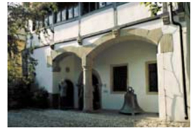
Eisleben, the "Lutherstadt": Martin Luther Birthplace