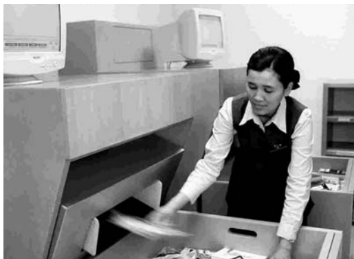
Auto cancellation of loans via bookdrop