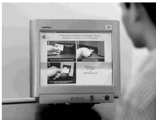
Borrower's Enquiry & Payment station