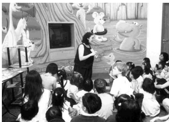
Storytelling at children's library