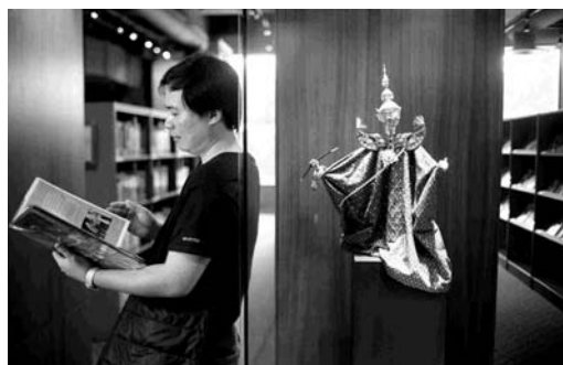
Browsing through the collections at library@esplanade