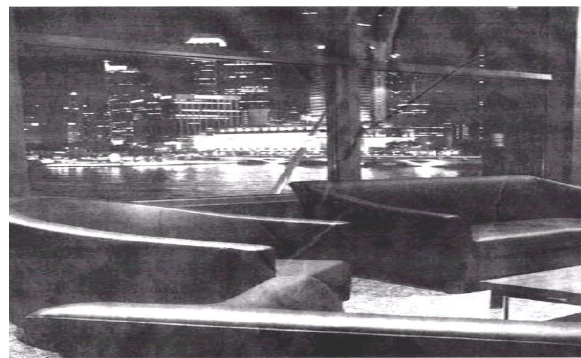
Reading Lounge – looking out to the seafront