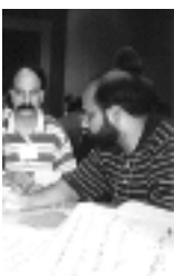
Colleagues from Pakistan