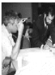
Colleagues from Pakistan