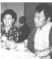
Colleagues from Malaysia & Samoa