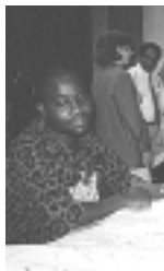
Colleague from Zambia