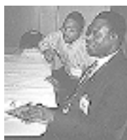
Colleagues from South Africa and Nigeria