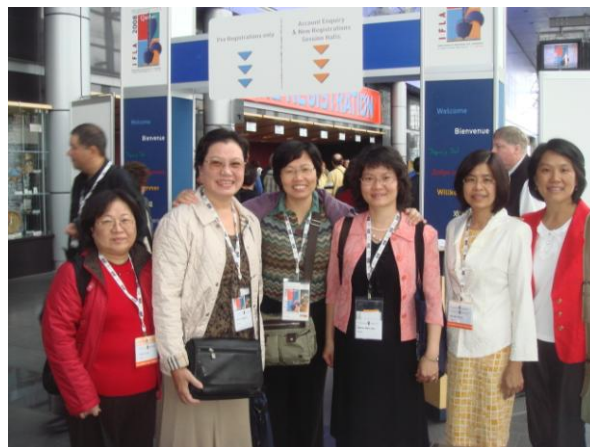
Taiwan Delegation of the 2008 IFLA Conference at Quebec, Canada

In order to promote international library exchange and cooperation, and enhance the broader international experience and vision, the Association strongly encourages its members to participate international library activities and international conferences. For the IFLA annual conference, the Association provides financial support for delegates to present papers and poster exhibit. In addition, it also recommends the eligible candidates to serve the IFLA Standing Committees.