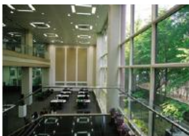
Sookmyung Women's University Library