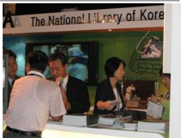
One of the hosts for library visits

Most sessions for LTR and Division VII take place on Wednesday, so Thursday will be advisable for visits.