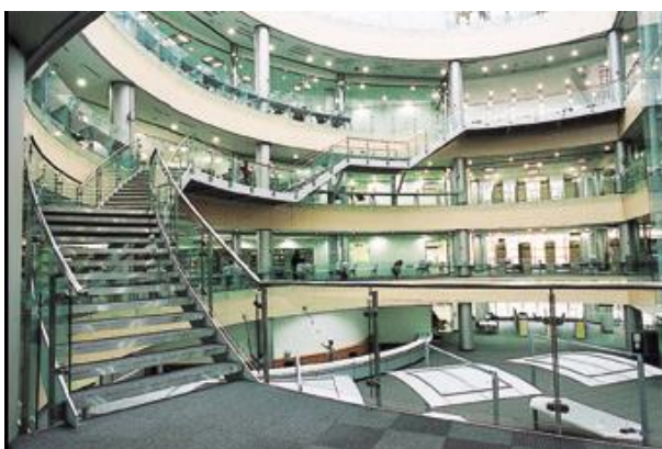
Tae-Joon Park Digital Library

Visits to 37 best libraries in Korea take place on Wednesday 23 August and Thursday 24 August and they all start at the COEX at 9:00 in the morning. The libraries are very pleased to welcome the colleagues from all over the world. A desk especially for questions regarding the Library Visits is set-up in the registration area.