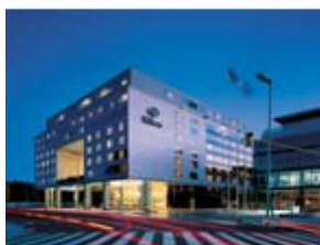
The Hilton, Buenos Aires venue of the IFLA 2004

The growth of disparate online publishing has been raising the need for e-resource management solutions that can integrate access services and support control over their usage. Authentication and authorization issues are a fundamental part of the solution.