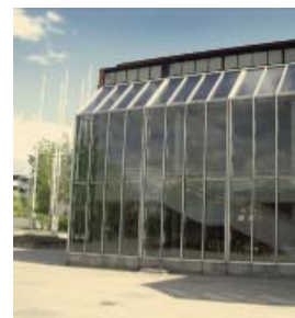
Venue - the Järvenpää Hall, Järvenpää, Finland.

See more information at http://www.ifa.fi/frbr05/ (available from 20 August 2004).