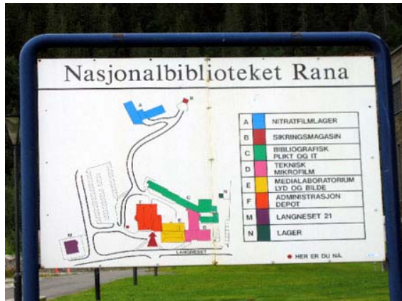
National Library of Norway (NLN), Mo i Rana