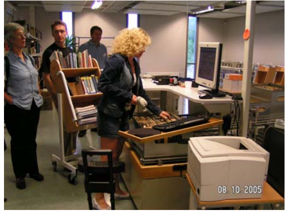
Repository Library – Processing Centre