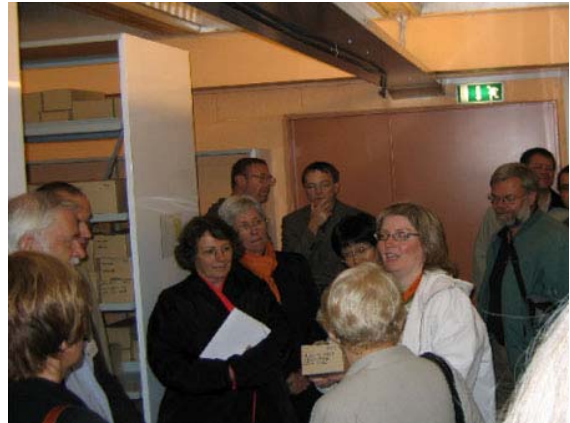
Tour of the Vault