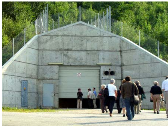
Mountain Storage Vault - Exterior