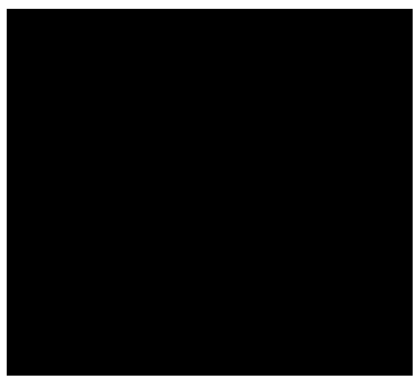
Chart 3 – Educational Level of Han Chinese and Ethnic Minorities in Tianzhu

For both populations, the level of education was low. More than 50% of Tianzhu and Tongwei populations had attended only a middle school or an elementary school and were thus less educated than their high school children. Thirty-one percent of Tianzhu population had attended a high school or a vocational school. Only slightly about 4% of the population from each group had attended a community college or a four-year college.