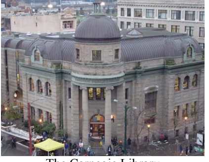
The Carnegie Library