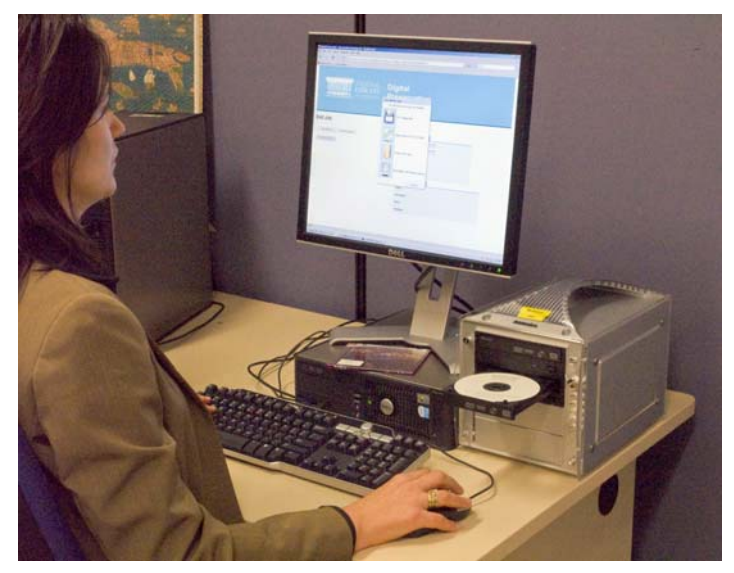
Figure 3: User selecting media for imaging via a mini-iukebox attached to a SOE workstation

An expected increase in the number of flash thumb drives and materials collected for upload from external hard drives can be accommodated by using a 'temporary scratch disc' on an optional internal hard drive inside the mini-jukebox, before transferring the imaged data into the system. Alternatively, the workflow system software could be loaded on to such an internal hard drive, so that the