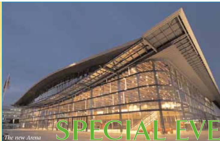
The new Arena

WORLD LIBRARY AND INFORMATION CONGRESS ▶ 73 rd IFLA General Conference and Council ▶ South Africa, 19–23 August 2007