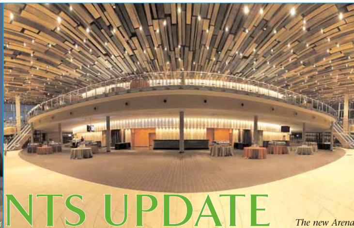
The new Arena