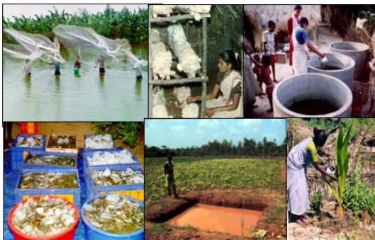
Multiple livelihood opportunities

We understand that mere provision of information cannot lead people out of the poverty trap. Access to relevant information is only part of the story. People need to build skills and capacities