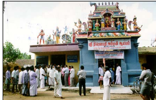
The door to modernity and the door to tradition at Embalam temple

“Embalam - In this village, the century-old temple has two doors. Through one lies tradition. People from the lowest castes and menstruating women cannot pass its threshold. Inside, the devout perform daily pujas, offering prayers. Through the second door lies the Information Age, and anyone may enter. In a rare social experiment, the village elders have allowed one side of the temple to house two solar-powered computers that give this poor village a wealth of data, from the price of rice to the day's most auspicious hours.”